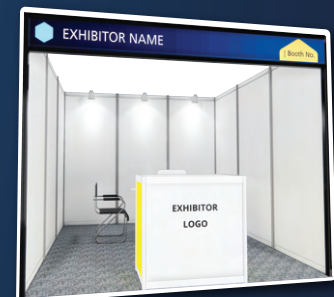
BASIC SHELL SCHEME

Smart Health Asia is a premier platform driving the transformation of healthcare by bringing together industry leaders to explore cutting-edge innovations, foster strategic connections, and shape the future of digital health in the region.