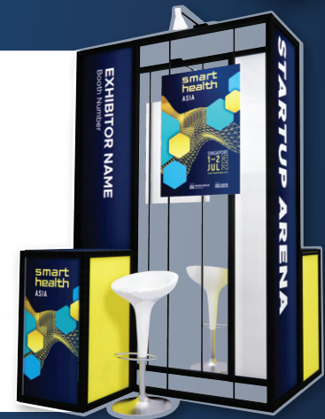
START UP POD